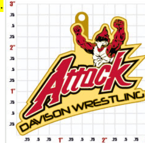
Actual Proof of Medal

CONTACT Bob Kemp, bobk@cardinalattack.com For up to date information visit www.cardinalattack.com